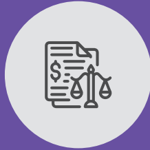
Preparation of Financial Statements