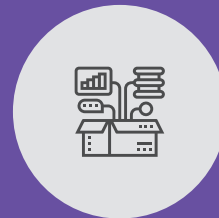
And Much More